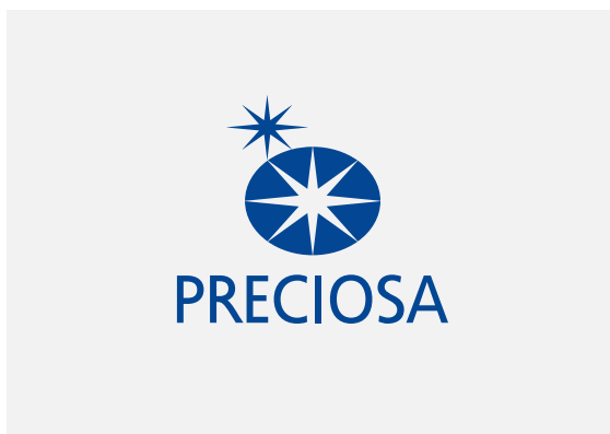
Retired logos used throughout Preciosa’s history